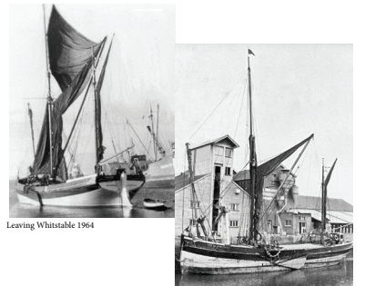
Leaving Whistable 1964

The Thames barge inherited the sprit rig from Holland. The sprit is a spar which locks rather like the jib of a crane and is attached to the foot of the mainmast and stretches diagonally across the mainmast to an eye fitted in the upper / outer end of the sail. Another Dutch inheritance is the leeboard - fan shaped boards, one on each side of the hull. As described by the name, the board which is on the 'leeboard' side of the barge (particularly when sailing unloaded) is lowered to enter the water beneath the hull, thus providing a false keel and aiding the sailing capabilities of the barge.